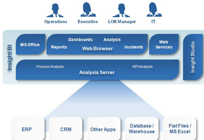
InsightBI supports delivery of business intelligence through dashboards, reports, Microsoft Office, web services, and more.

The Analysis Server works with the Insight Dashboard and other front-end InsightBI components, gathers requisite data from data sources, and returns the result for visualization or analysis by end users, or through Altosoft’s web services API. The Analysis Server dynamically manages interactions with source data to ensure that users are only able to access and visualize the data that they are permitted to see. Access can be based on individual privileges or role-based privileges, including support for LDAP.