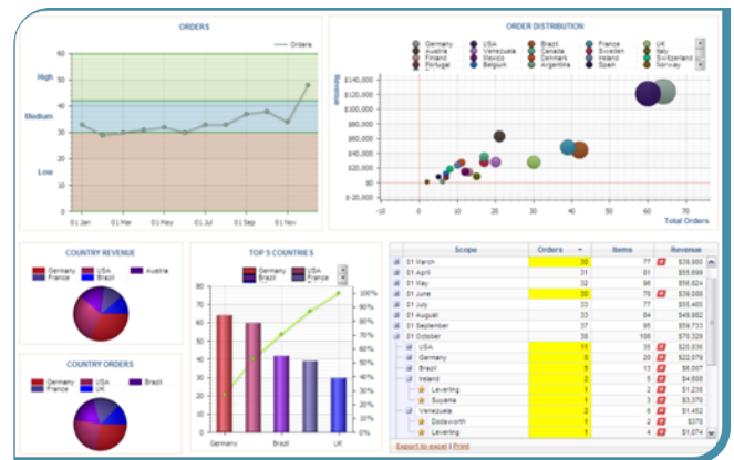
Altosoft dashboards are powerful and easy-to-use.